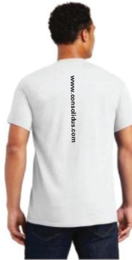
Back Vertical Center