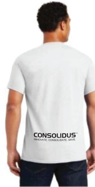
Lower Back Center