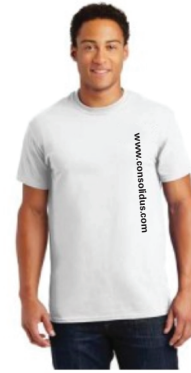
Right Vertical Chest