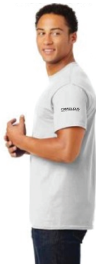
Left/Right Sleeve Bicep