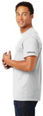
Left/Right Sleeve Above Cuff