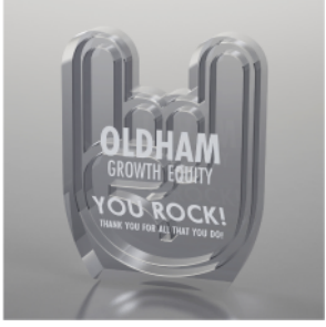
CATALOG SAMPLE ART