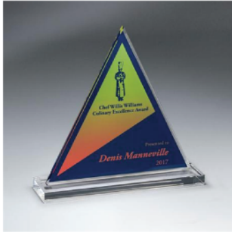
CATALOG SAMPLE ART

Please make sure that your artwork has all text elements (either within logos or copy areas) above the font size listed.